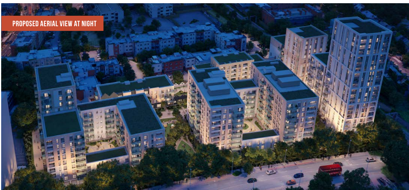
PROPOSED AERIAL VIEW AT NIGHT