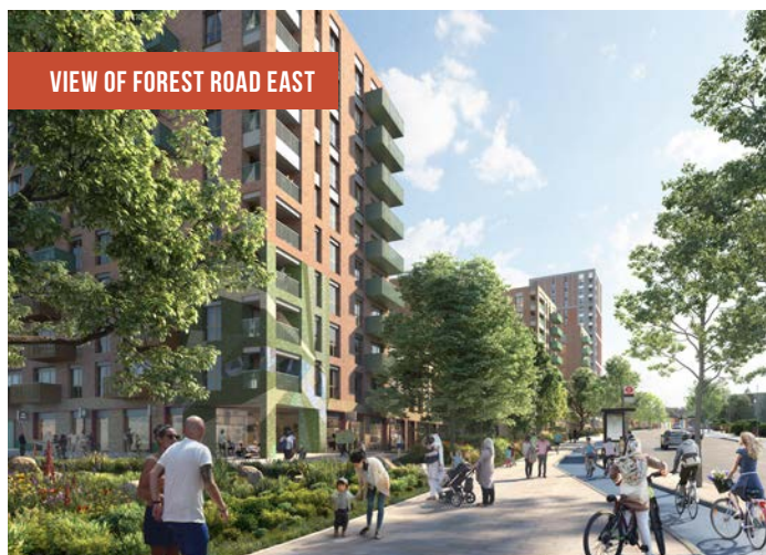
VIEW OF FOREST ROAD EAST