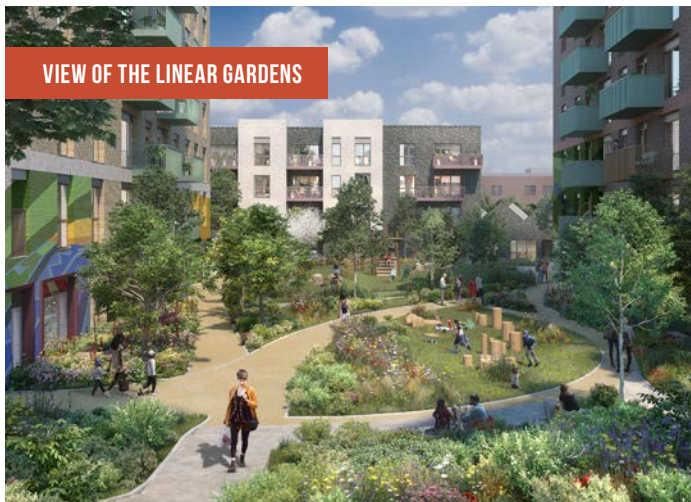
VIEW OF THE LINEAR GARDENS